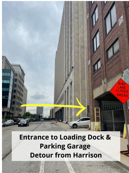
Turn right for parking garage