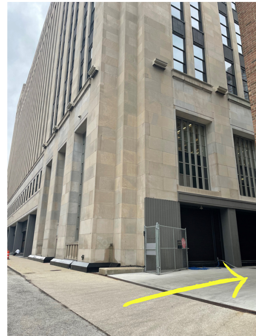
Entrance to access parking garage

The Old Post Office features an on-site, indoor parking garage that allows you to park at your convenience. Located conveniently off of Harrison Street, guests enjoy direct access to our parking garage.