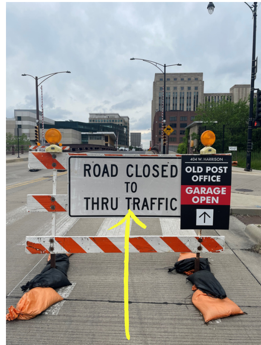
Wacker & Harrison St., looking west; Will need to bypass the "Road Closed To Thru Traffic" sign